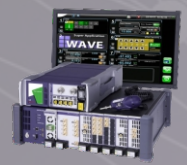
Production & Lab Test