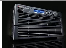
DC Power Supplies

World Leader in Designs, Manufactures of Thermal Imaging Infrared Cameras for law enforcement, aircraft, radiometry, ground-based security, thermal imaging, radar surveillance systems chemical and explosive detection products etc.